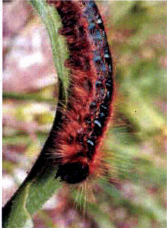
Educational nature trail