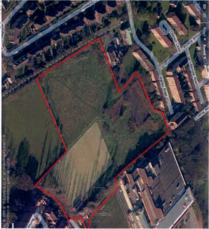
Aerial view of site