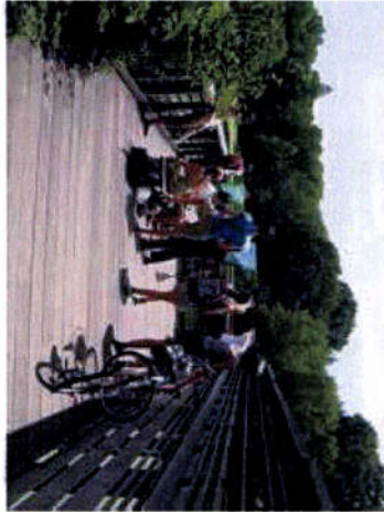
Pond with viewing platform